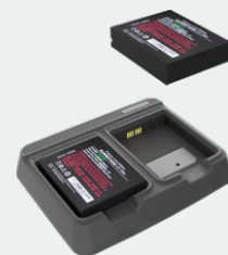
Dual-Slot Battery Charger