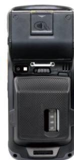
Finger print (4000mAh battery)

2 inch thermal printer 30mm paper roll Supports 2D barcode printing